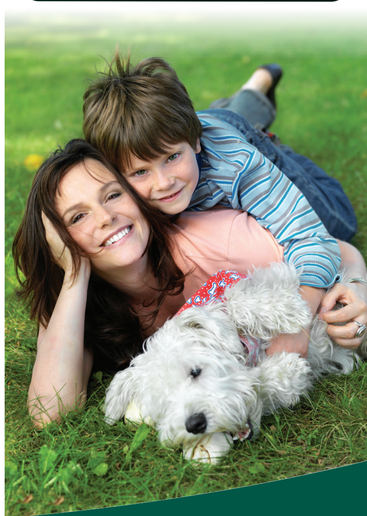
Distributed Worldwide Since 1922